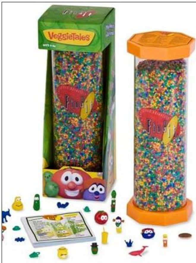
Find It "VeggieTales" is fun for the whole family -- just try prying it out of Dad's hands.

When both your husband and your children are fighting over a toy, you know it's a keeper.